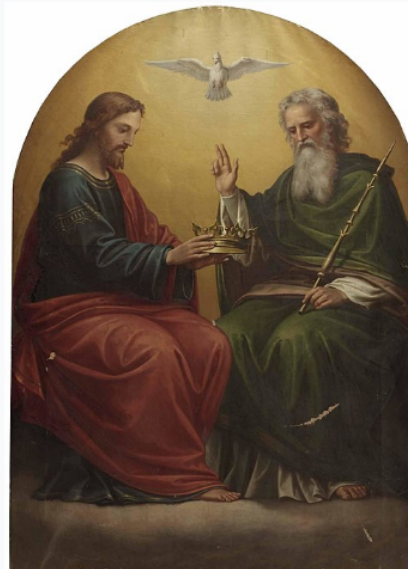
The Blessed Trinity with Crown , oil on panel, Max Fürst (1846–1917)