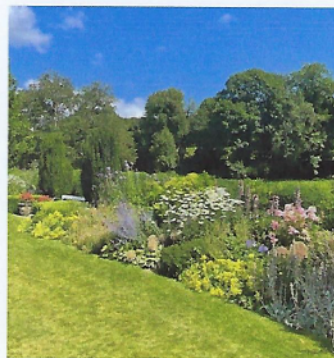
for those coming from afar. Chalk Pyt Gardens